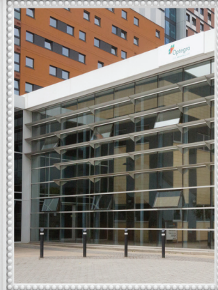
Optegra Eye Hospital Birmingham