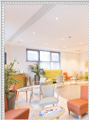
Optegra Eye Hospital North London