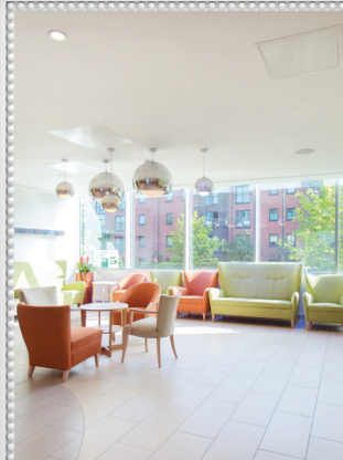
Optegra Eye Hospital Manchester