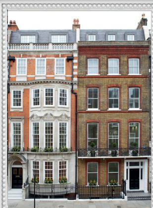
Optegra Queen Anne Street, London

Optegra's Eye Hospital's across the Country