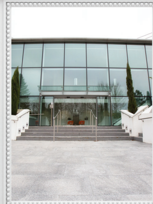
Optegra Eye Hospital Hampshire