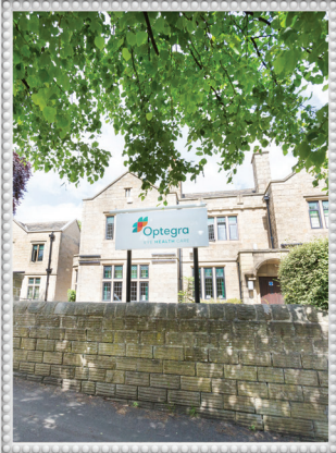
Optegra Eye Hospital Yorkshire